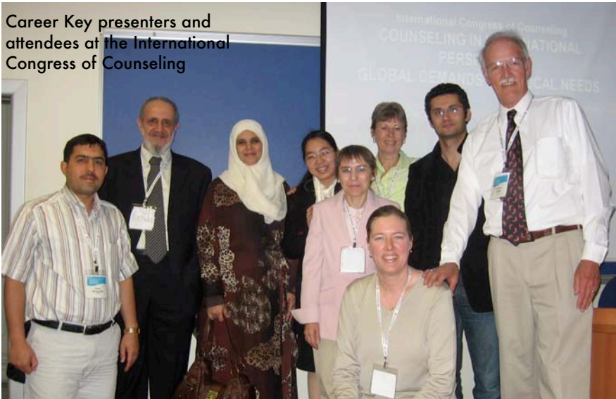
Career Key presenters and attendees at the International Congress of Counseling